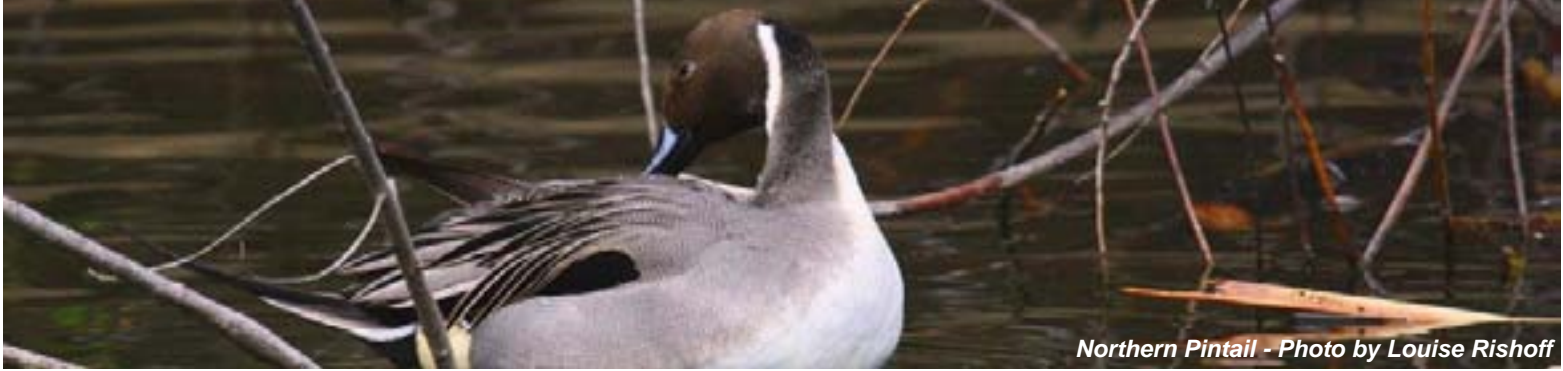
Northern Pintail